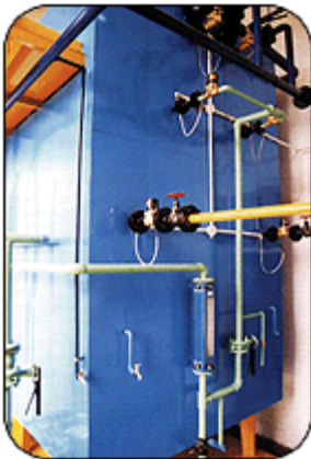
Typical MBR operating system and module 典型的 MBR 系统及装置

The Membrane bioreactor (MBR) is a recent but increasingly utilised technology for treating municipal and high organic industrial wastewater by combining the highly efficient separation technology of hollow fiber membranes within a compact activated sludge process.